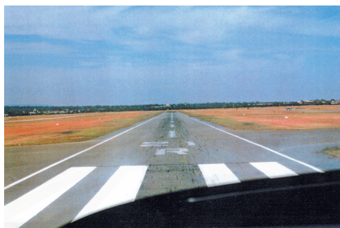
Figure 5-6 Runway threshold.

5.74 Permanent threshold markings are used at the ends of sealed or concrete runways. Where the width of the runway is 30 m or more, this marking is always used; for runways less than 30 m wide, the marking may be used. It consists of a series of parallel longitudinal white lines resembling piano keys .